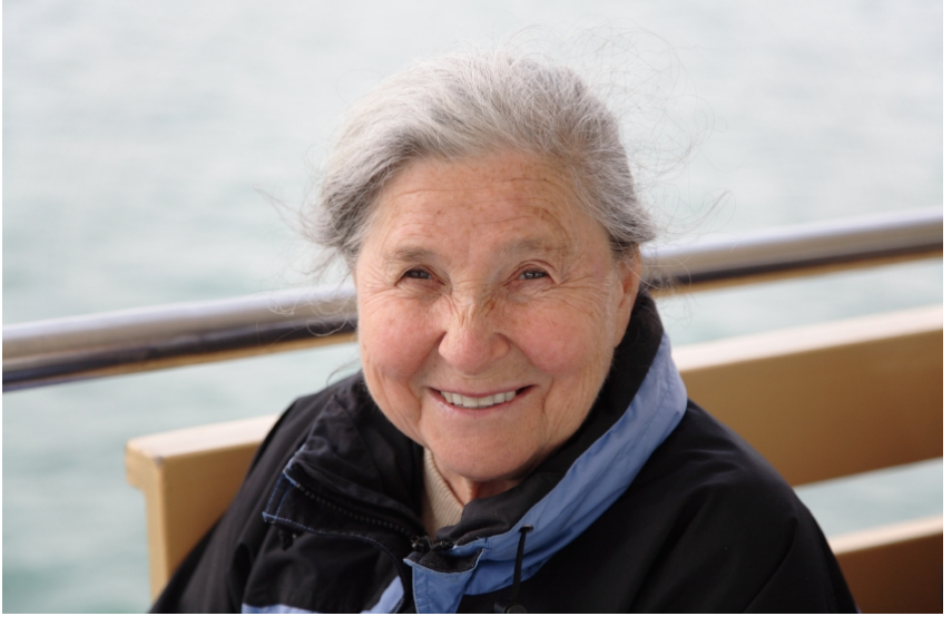
Mother's Day and Mom's 85th